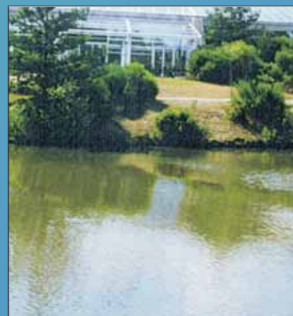
With TLC Use!

See Reverse Side for Technical Information about TLC Golf Pond Treatment.